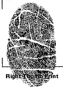
Right Thumb Print