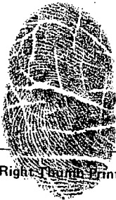
Right Thumb Print